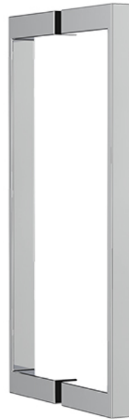
Double Door Handle shown with no Rosette